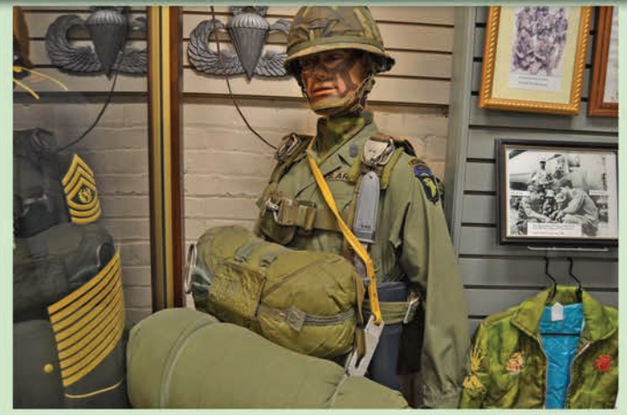
Thousands of authentic exhibits are on display at the Alabama Veterans Museum