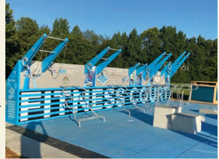
The new Fitness Court at Athens Sportsplex

municipal athletic facilities in the United States. It has eight baseball fields and five soccer fields designed for various levels of amateur competition, disc golf course, kids dugout playground complex, outdoor fitness court, pickleball court, and a swimming pool.