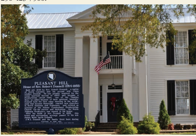
The Donnell House, known as Pleasant Hill, is within the Beaty Historic District.

Ardmore Walking Tracks - A 1/4-mile walking track is located in the beautiful Ardmore, AL Town Park located on Park Avenue and a 1/2-mile walking track under the shade trees in the Ardmore, TN John Barnes Park located on Ardmore Ridge Road. Both have a kids' playground area close to the track. Contact 256-423-7588.