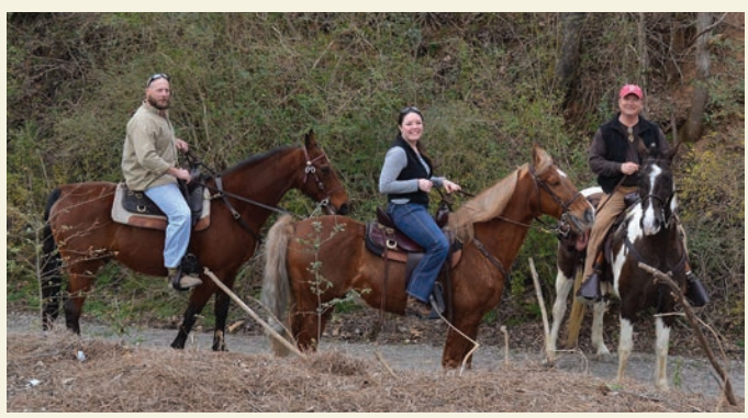
The 10.3-mile Rails to Trails path welcomes everyone from harseback riders to hikers and bicyclists.