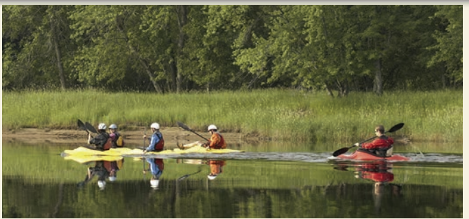
The 21.9 mile Limestone County Canoel Kayak Trail travels north to the Tennessee state line